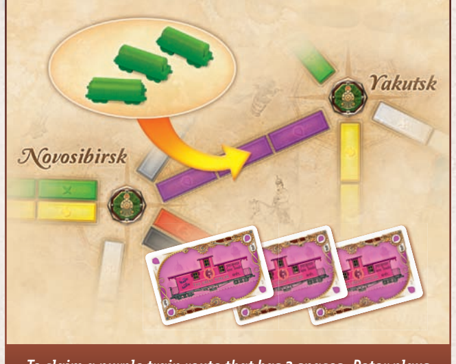
To claim a purple train route that has 3 spaces, Peter plays three purple Train cards. Any of them could have been replaced by a Wild card.

When a route is claimed, the player places one of his plastic trains (or ships) in each of the route's spaces. Then all the cards played to claim the route are discarded, and the player immediately updates his score by moving his scoring marker along the scoring track equal to the number of spaces indicated by the route scoring table printed on the board.