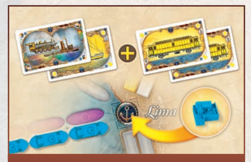
Alan uses one wild and one yellow Ship card plus two yellow Train cards to build a harbor in Lima.