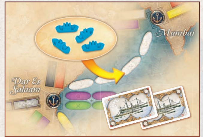
To claim a white ship route that has 4 spaces, Steven plays two white Double-Ship cards. He could have played four white Single-Ship cards, two white Single-Ship cards and one white Double-Ship card, or any other combination matching this color and number, including Wild cards.

A player can claim any open route on the board. He is not required to connect to any of his already claimed routes. A player can claim a maximum of only one route on his turn.